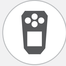
ALTAIR io 4